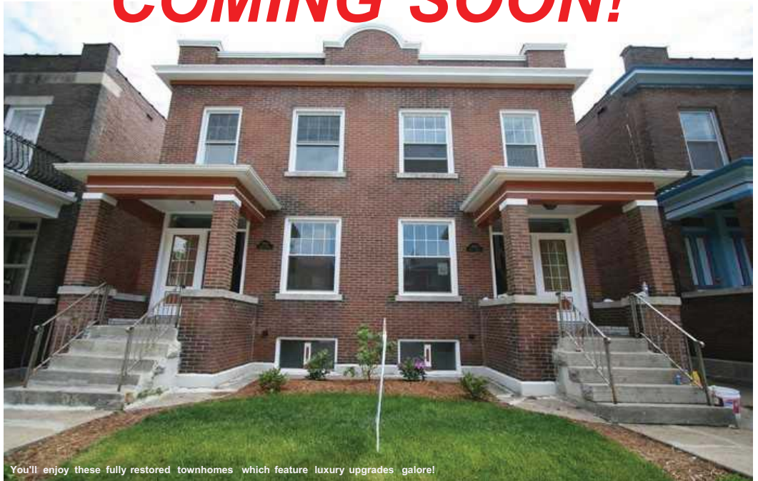
You'll enjoy these fully restored townhomes which feature luxury upgrades galore!