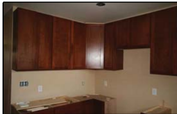
New 42 inch Kitchen Cabinets being installed NOW.